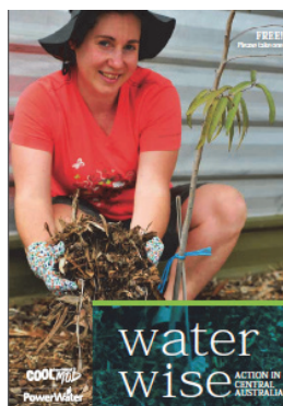
Water Wise Action in Central Australia