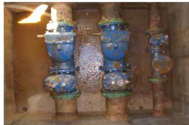
Plate 3 - Valve Pit