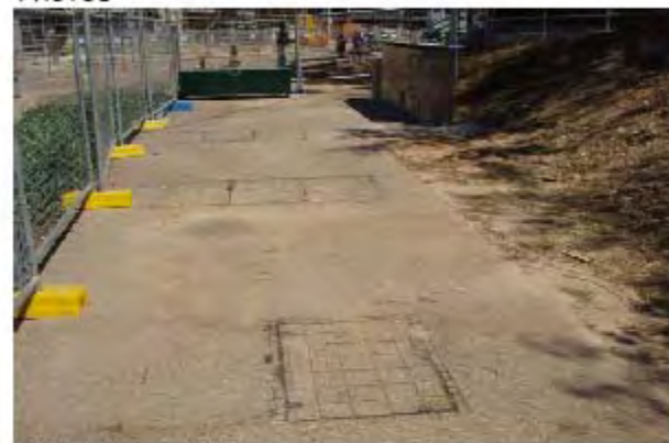
Plate 1 - Location Photo