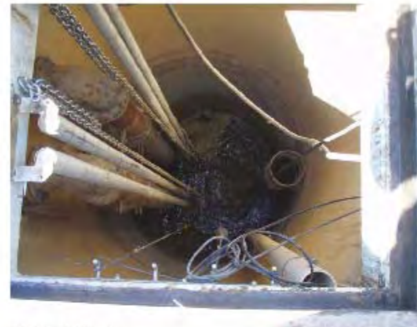
Plate 2 - Wet well