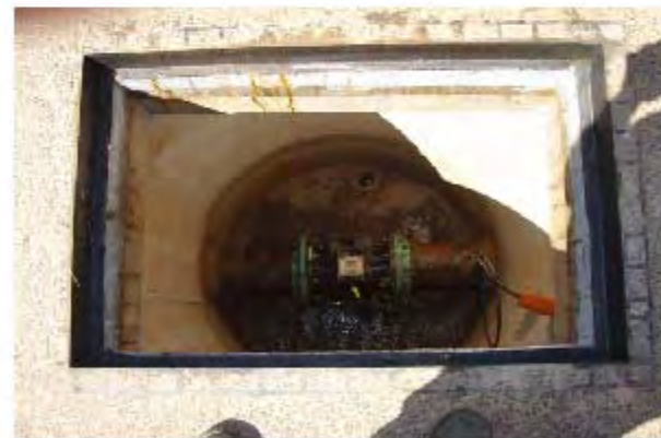
Plate 4 - Meter Pit