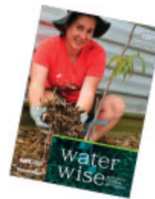
Water Wise Action in Central Australia