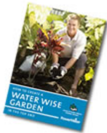
How to create water wise garden in the Top End

For more information, download a free copy of: